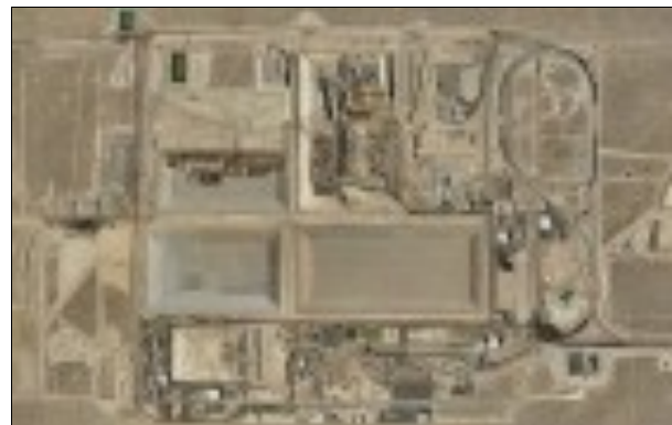
Aerial view of the Clive facility